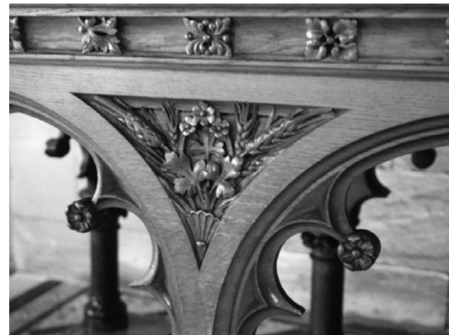
Typical altar carving

St John's church has, along with two other parishes the oldest Parish Register in England, 1528. Whilst the original cannot be viewed at the church a complete abstract of all the entries to-date is available to be seen for all those budding genealogists.